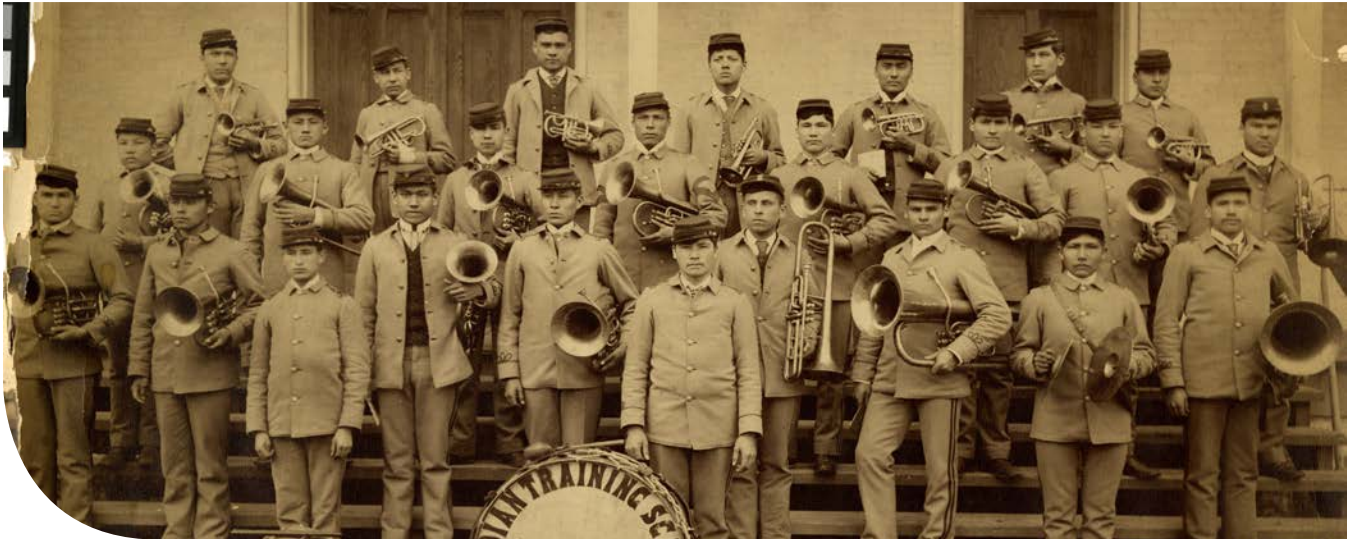
Carlisle Indian Industrial School Band, 1895. Photo by U.S. Army Military History Institute..