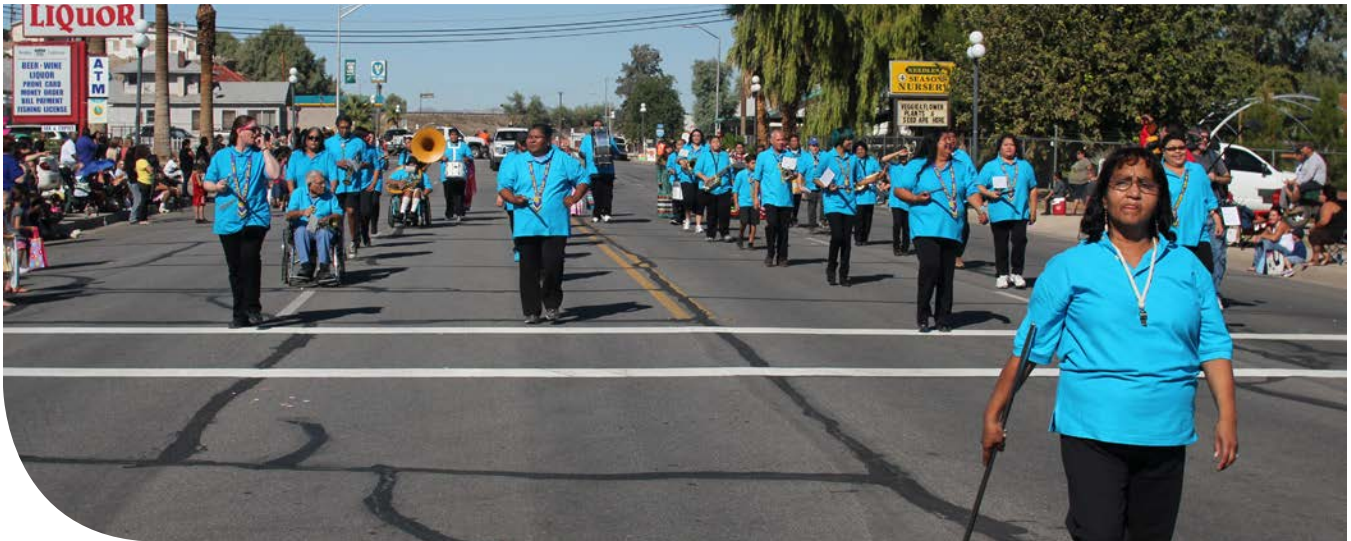
The Fort Mojave Indian Tribal Band leads the 2011 Indian Days Parade in Downtown Needles, California.