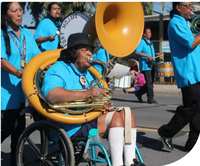
The Fort Mojave Indian Tribal Band leads the 2011 Indian Days Parade in Downtown Needles, California.

Sousa on the Rez: Marching to the Beat of a Different Drum profiles two different American Indian marching bands: The Fort Mojave Indian Tribal Band in Needles, California; and the Iroquois Indian Band of upstate New York. It traces the history of bands in Native communities, starting with the boarding school bands of the late 19th century and continuing through the era of professional touring bands that ended after World War II. Today only four community-based Native American marching bands remain, and two of these groups are featured in this film.