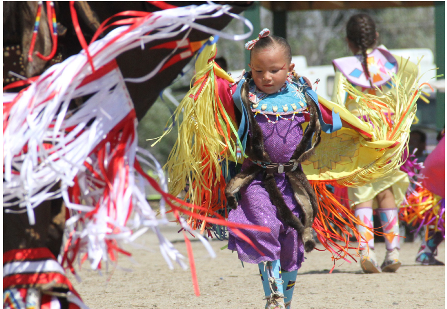
Right: A child dances at the grand entry into the Ethere Powwow on the Wind River Reservation.