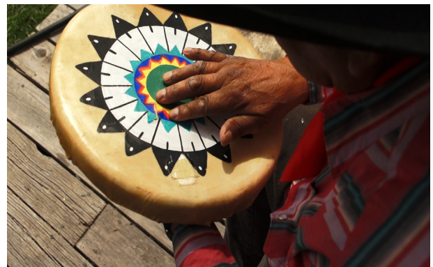
Philbert McLeod makes a ceremonial hand drum.