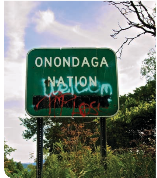
Onondaga Nation road sign.