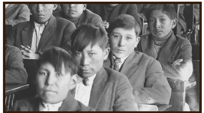
Still image of Native American boarding school students from The Thick Dark Fog .