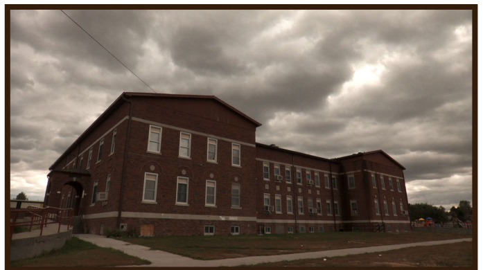
The original girls’ dormitory building at Oglala Community High School.