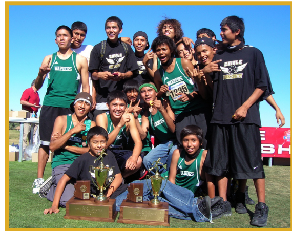
Tuba City and Chinle trophies at State 2008.