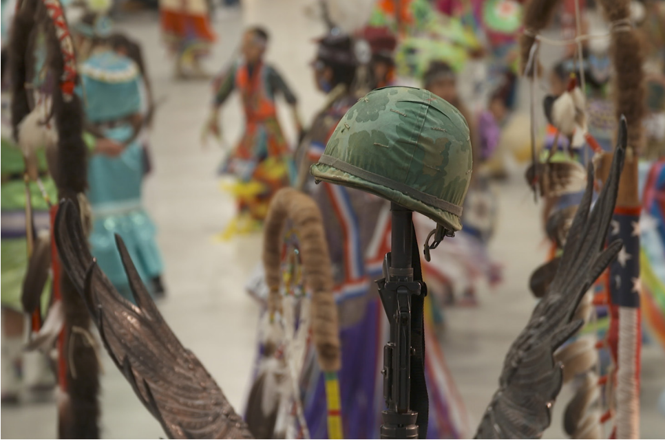
25th Annual Sisseton Wahpeton Veteran's Day Powwow.