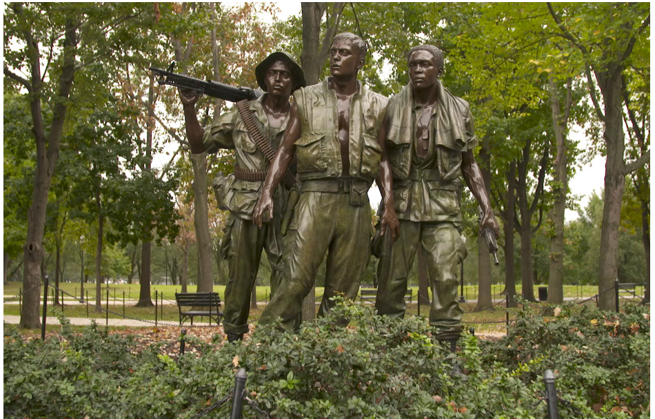
Washington D.C. Vietnam Veterans Memorial "The Three Soldiers".