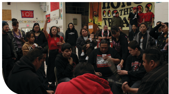
The Oyuh’pa Singers of Manderson, S.D., sing for the protection of water.