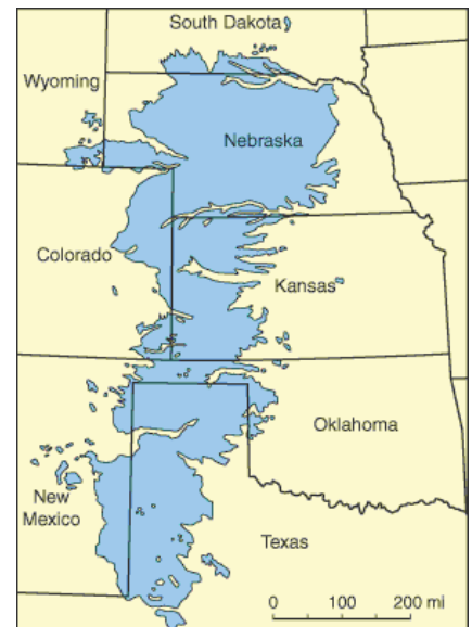
Pictured Left: Map of U.S. Aquifers

A Lakota mother studying geology seeks the source of the water contamination that caused her daughter's critical health problems. Meanwhile, a Lakota grandmother fights the regional expansion of uranium mining. Crying Earth Rise Up exposes the human cost of uranium mining and its impact on Great Plains drinking water.