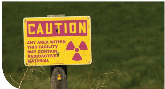
A sign across the street from a local rancher warns passerby at the boundary of Cameco’s Crow Butte mine in Crawford, Neb.