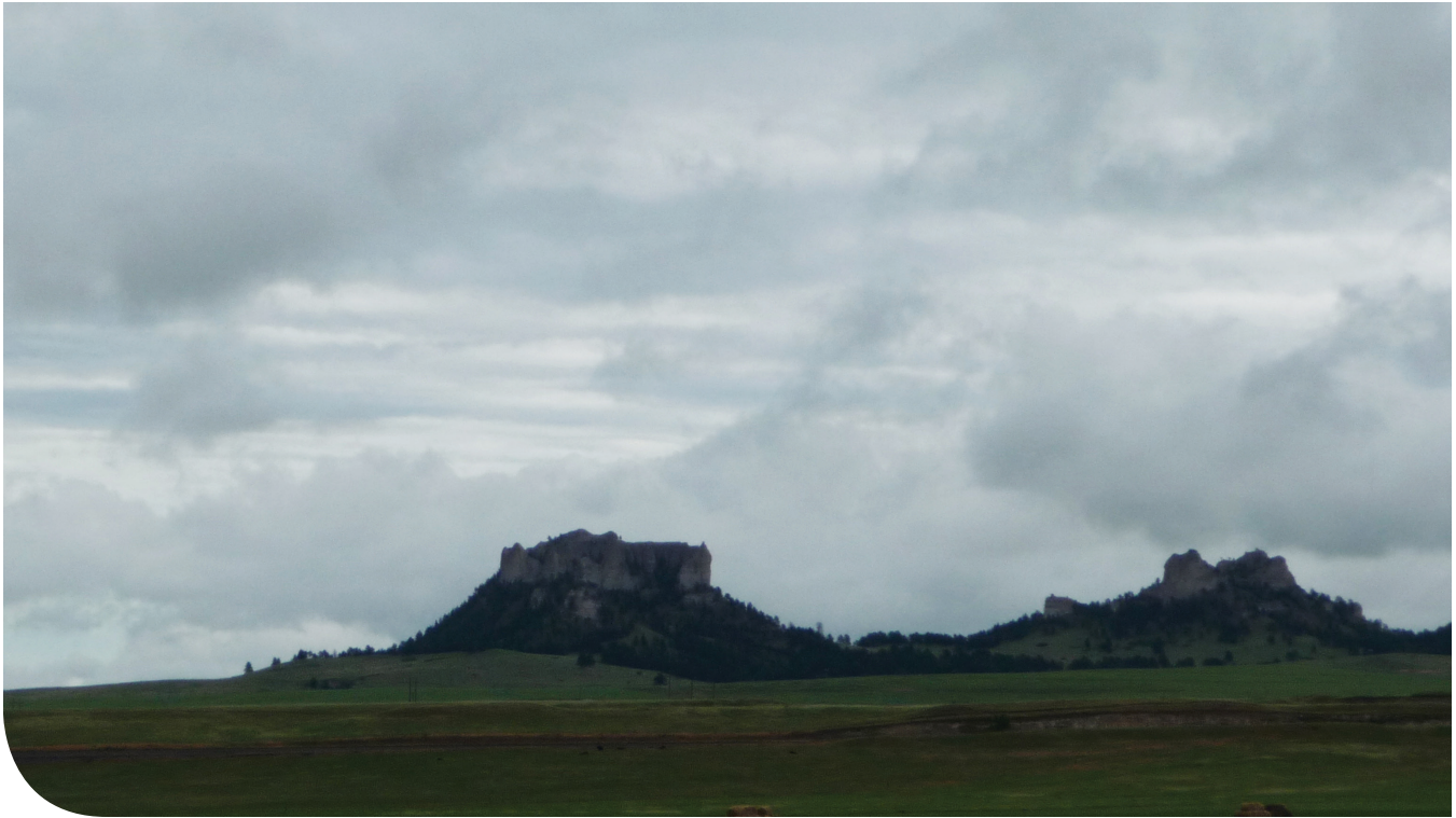
Cameco's uranium mine sits at the base of Crow Butte, a sacred Lakota site.