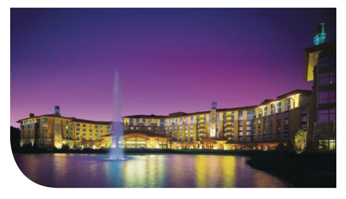
Soaring Eagle Casino & Resort. in Mt. Pleasant, Michigan.