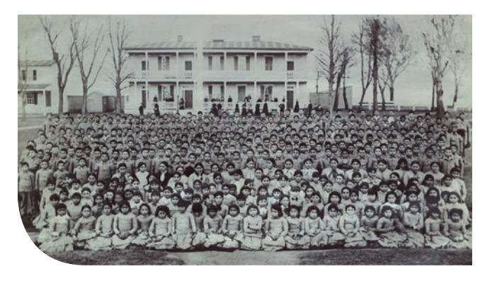
Student body assembled on the Carlisle Indian Industrial School grounds in