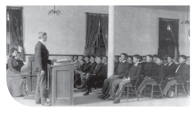
Possibly taken during Chapel Service depicting Native American students at the Carlisle Indian Industrial School in Carlisle, Pennsylvania.