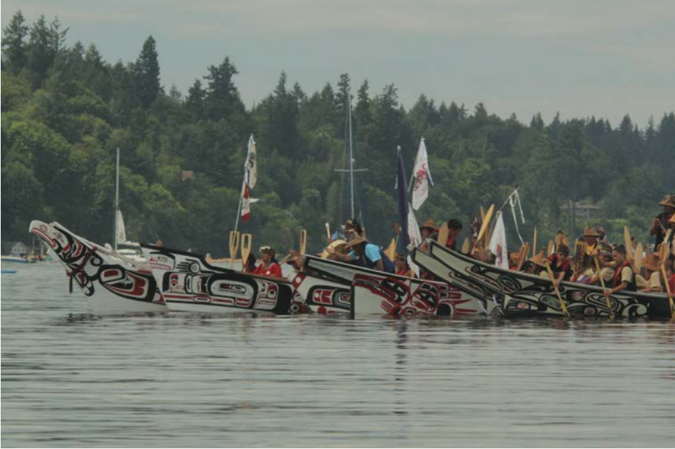
Image of Canoe Journey rowers arriving at Port of Olympia, WA.