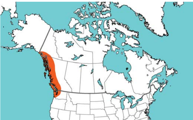
Film location: Pacific Northwest